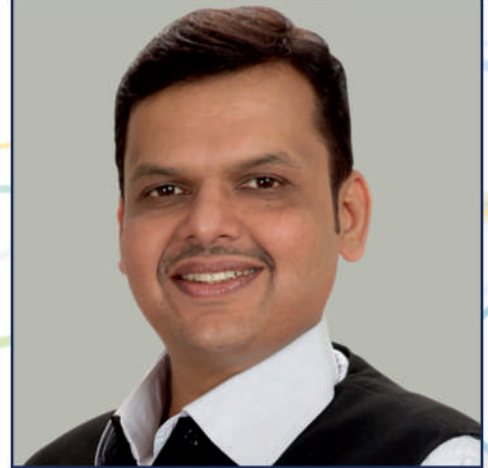
Hon. Shri. Devendra Fadnavis Dy. Chief Minister, Maharashtra State